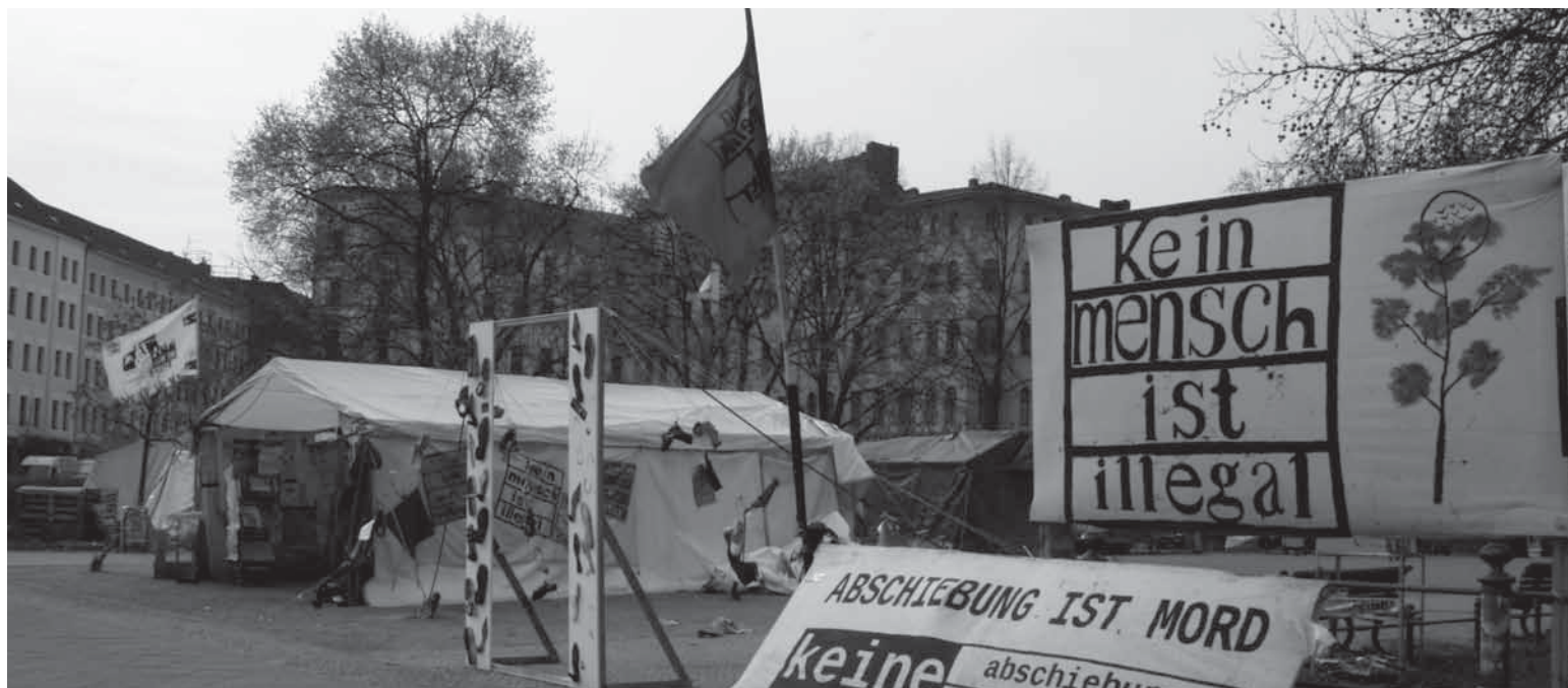
Photo of the refugee protest camp on Oranienplatz in Berlin-Kreuzberg, Germany. Slogan on the upper sign: No human being is illegal. Slogan on the lower sign: Deportation is murder.