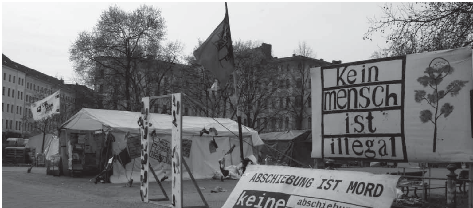
Photo of the refugee protest camp on Oranienplatz in Berlin-Kreuzberg, Germany. Slogan on the upper sign: No human being is illegal. Slogan on the lower sign: Deportation is murder.